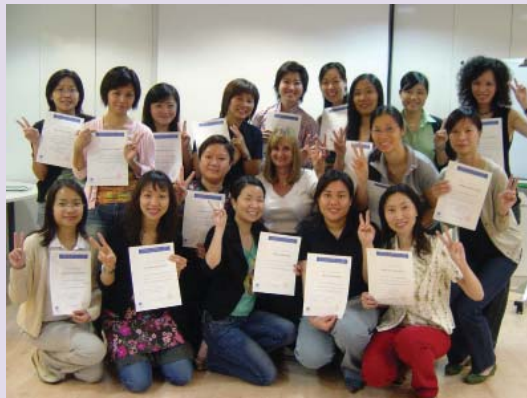
Fleur Graduates Hong Kong Fleur 香港畢業生