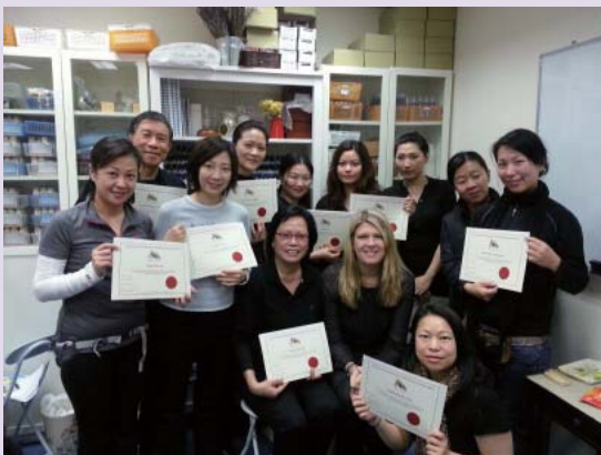
Principal and HKMA Hong Kong students 2013 2013 年度 HKMA 香港畢業生與校長合照 (April Intake)