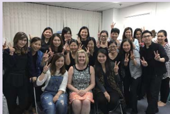
Principal and HKMA Hong Kong students 2016 2016 年度 HKMA 香港畢業生與校長合照 (April Intake)