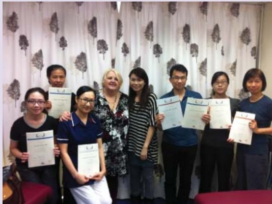
IFPA External Examiner and Hong Kong students 2012 2012 年度香港學生與 IFPA 主考官合照 (Apr Intake)