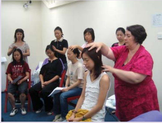
Indian Head Massage (2008 CPD Seminar) 印度頭部按摩 (2008 CPD 講座)