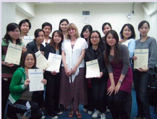
Principal and HKMA Hong Kong students 2009 2009 年度 HKMA 香港畢業生與校長合照 (April Intake)