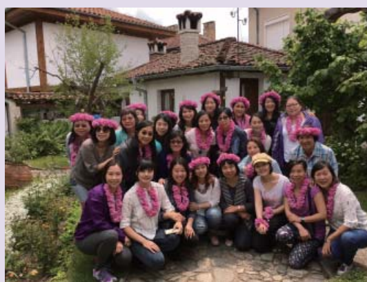
2016 保加利亞玫瑰之旅 Bulgarian Rose Tour