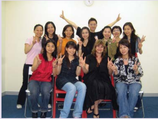
Principal and HKMA Hong Kong students 2008 2008 年度 HKMA 香港畢業生與校長合照