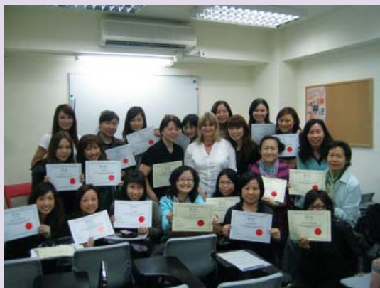
Principal and HKMA Hong Kong students 2010 2010 年度 HKMA 香港畢業生與校長合照 (April Intake)