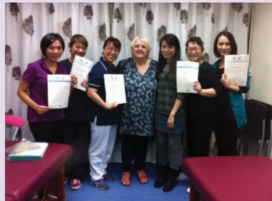
IFPA External Examiner and Hong Kong students 2012 2012 年度香港學生與 IFPA 主考官合照 (Apr Intake)