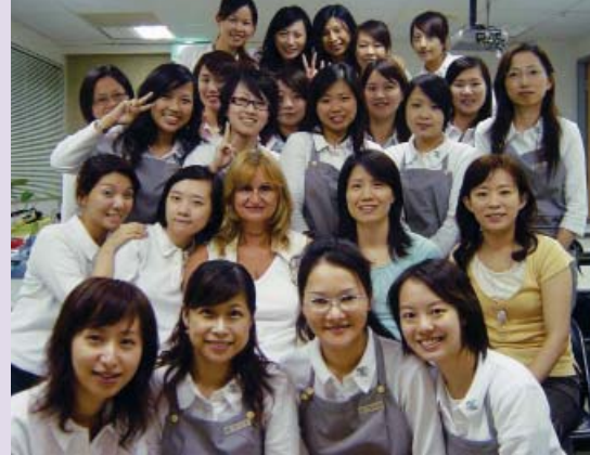
Taiwan Students 2007 2007 年度台灣學員