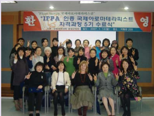
Principal and Korean students 2007 校長與 2007 年度韓國學員留影