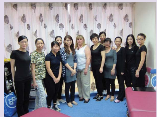
IFPA Examiner and HKMA Hong Kong students 2011 2011 年度 HKMA 香港學生與 IFPA 主考官合照 (Oct Intake)