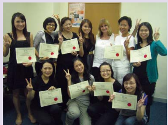
Principal and HKMA Hong Kong students 2009 2009 年度 HKMA 香港畢業生與校長合照 (October Intake)