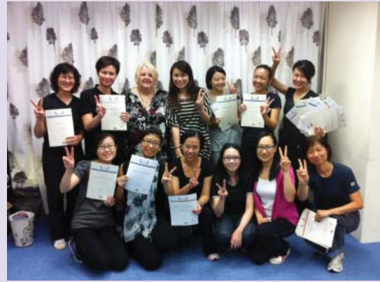
IFPA External Examiner and Hong Kong students 2012 2012 年度香港學生與 IFPA 主考官合照 (Apr Intake)