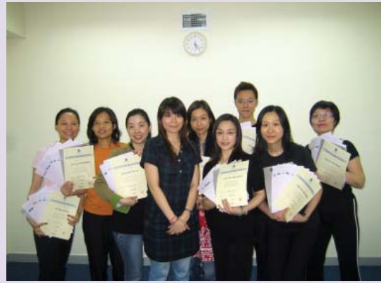
HKMA Hong Kong graduates 2008 2008 年度 HKMA 香港畢業生