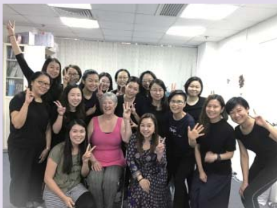
Principal and HKMA Hong Kong students 2016 2016 年度 HKMA 香港畢業生與校長合照 (November Intake)