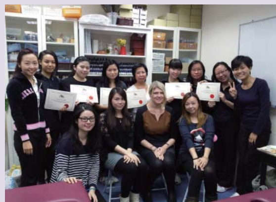
Principal and HKMA Hong Kong students 2013 2013 年度 HKMA 香港畢業生與校長合照 (April Intake)