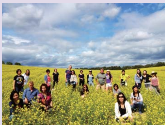
2013 法國普羅旺斯香薰之旅 Provence, France Aromatherapy Tour