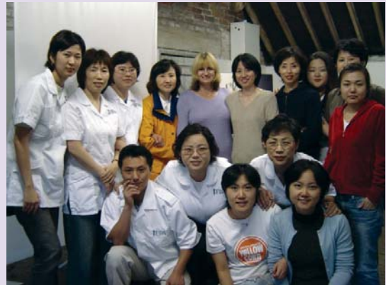
Field trip to England visiting the Lavender farm 學員參加英國薰衣草農場的實地考察