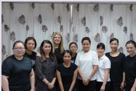
Principal and HKMA Hong Kong students 2014 2014 年度 HKMA 香港畢業生與校長合照 (November Intake)