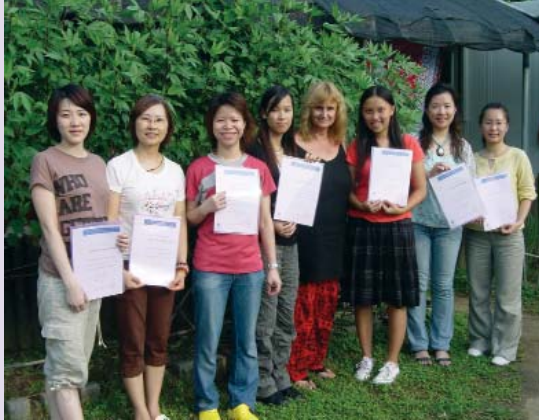
HKMA Hong Kong first graduates 2006 2006 年度 HKMA 第一屆畢業生

Fleur 國際專業香薰治療學院是 IFPA 認可的院校之一，是一間在英國擁有 25 年經驗的專業香薰學院，在香港辦學亦超過十二年。Fleur 的院校遍佈香港、台灣及韓國等地，而且將會在墨西哥、日本和上海等地開設新的院校。至目前為止，從 Fleur 畢業後成為 IFPA 會員的人數超過 1000 人。如欲了解更多關於 FLEUR 的資料，歡迎到以下網頁瀏覽 http://www.fleuraroma.com.hk